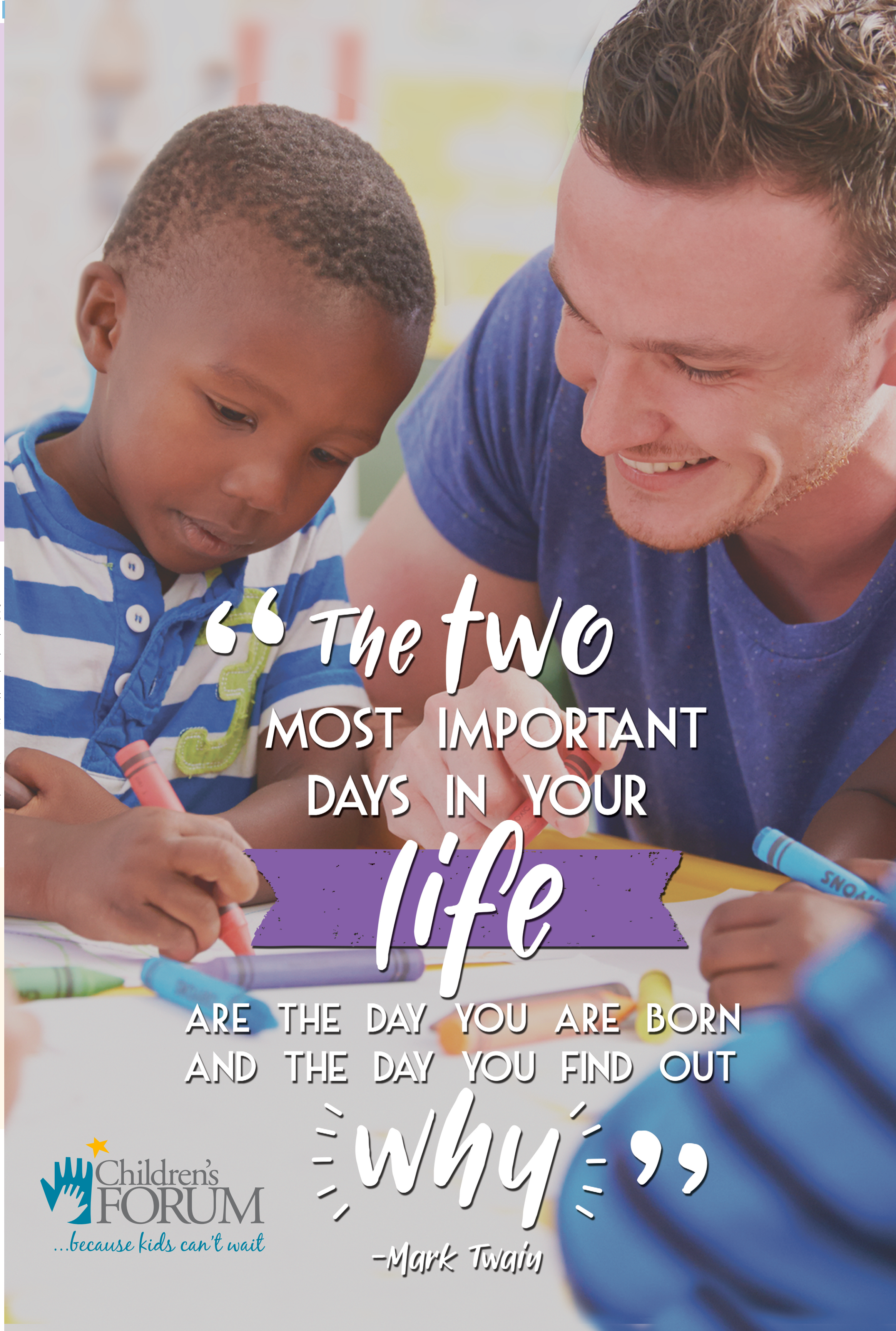
XC-Cut along the edge and hang this poster to inspire others!

“The two MOST IMPORTANT DAYS IN YOUR life