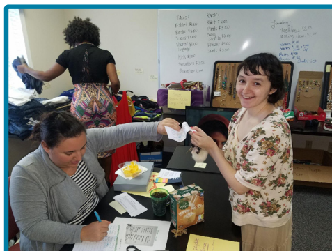
A satisfied customer