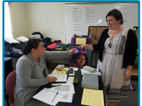
Taking home treasures