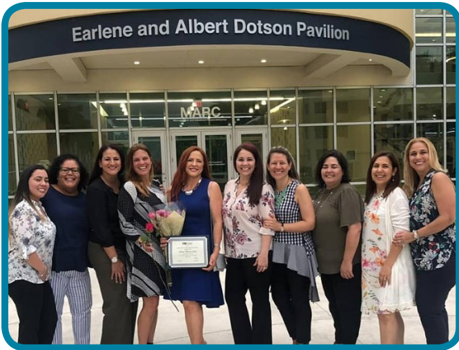
The Early Learning Career Center team , along with the Children's Trust and Florida International University (FIU) professors, celebrated the graduations of early childhood educators from FIU! These educators will impact children in the Miami-Dade community.